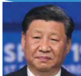
XI JINPING President of the People's Republic of China

"We are ready to come together with Russia and channel our combined efforts into cooperation in such key areas as infrastructure, energy, agriculture, tourism, mobilizing small and medium-sized businesses, strengthening the role of technology in cooperation, increasing the added value of production, using our respective advantages to complement each other, and achieving mutual benefits through fruitful Chinese-Russian cooperation in the Far East."