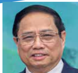
PHAM MINH CHINH Prime Minister of Vietnam

"India is interested in strengthening its partnership with Russia on many issues, including those related to the Arctic. We also have tremendous opportunities for cooperation in the energy sector. In addition to the energy sector, India has also made significant investments in areas such as pharmaceuticals and the diamond industry in the Russian Far East."