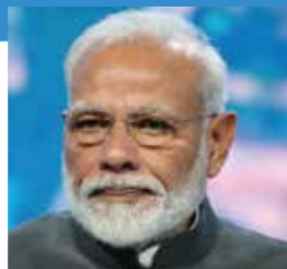
NARENDRA MODI Prime Minister of the Republic of India

"We are ready to come together with Russia and channel our combined efforts into cooperation in such key areas as infrastructure, energy, agriculture, tourism, mobilizing small and medium-sized businesses, strengthening the role of technology in cooperation, increasing the added value of production, using our respective advantages to complement each other, and achieving mutual benefits through fruitful Chinese-Russian cooperation in the Far East."