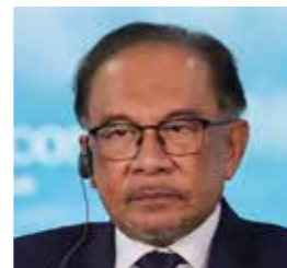
ANWAR BIN IBRAHIM Prime Minister of Malaysia

"In terms of multilateral cooperation, Vietnam values the role of the Russian Federation in the Asia-Pacific region and supports Russia's course towards expanding economic cooperation with the countries of the Asia-Pacific region, including by utilizing the rich potential of the Russian Far East. I would particularly highlight key areas such as ensuring logistic chains, reliable supplies of goods, raw materials, food, as well as maritime transportation."