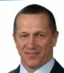
YURY TRUTNEV RUSSIAN DEPUTY PRIME MINISTER AND PRESIDENTIAL PLENIPOTENTIARY ENVOY TO THE FAR EASTERN FEDERAL DISTRICT

"It is a real pleasure to be finally in Vladivostok, where history blends seamlessly with progress, and where the vastness of Russia meets the boundless promise of the Asia-Pacific. Beyond its economic significance, Vladivostok holds a distinctive place in Russian history as a vital seaport and the eastern terminus of the legendary Trans-Siberian Railway. This city truly embodies Russia's connection with the East."